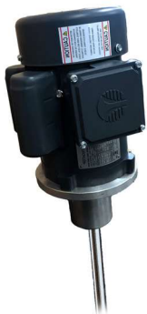
DRUM BUNG MOUNT

Collapsible impellers expand internally to provide increased mixing in closed head drums.