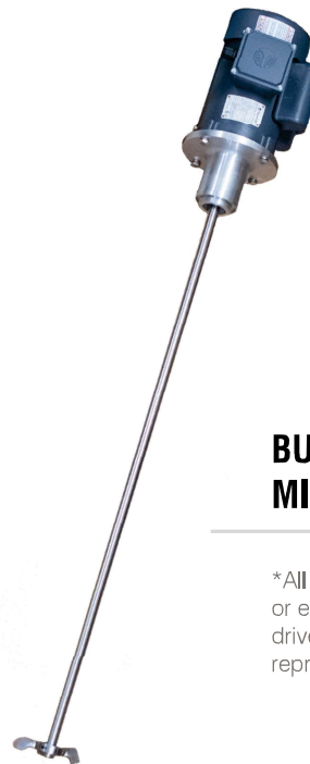
BUNG MOUNT AIR/ELEC. MIXER

*All models are available with air or electric MMX Bung Drum Mount drives. These mixers are typical representations.